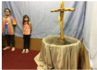
Dropping sins at the cross

The children at ROAR Vacation Bible School talked about sin and then dropped their sins in the form of a stone at the foot of the cross.