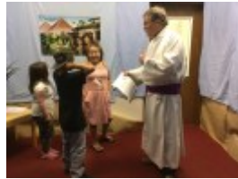
Plague of frogs etc.