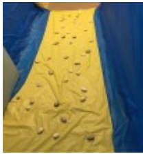
Red Sea dry