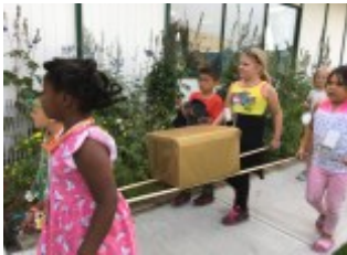
The Ark of the Covenant